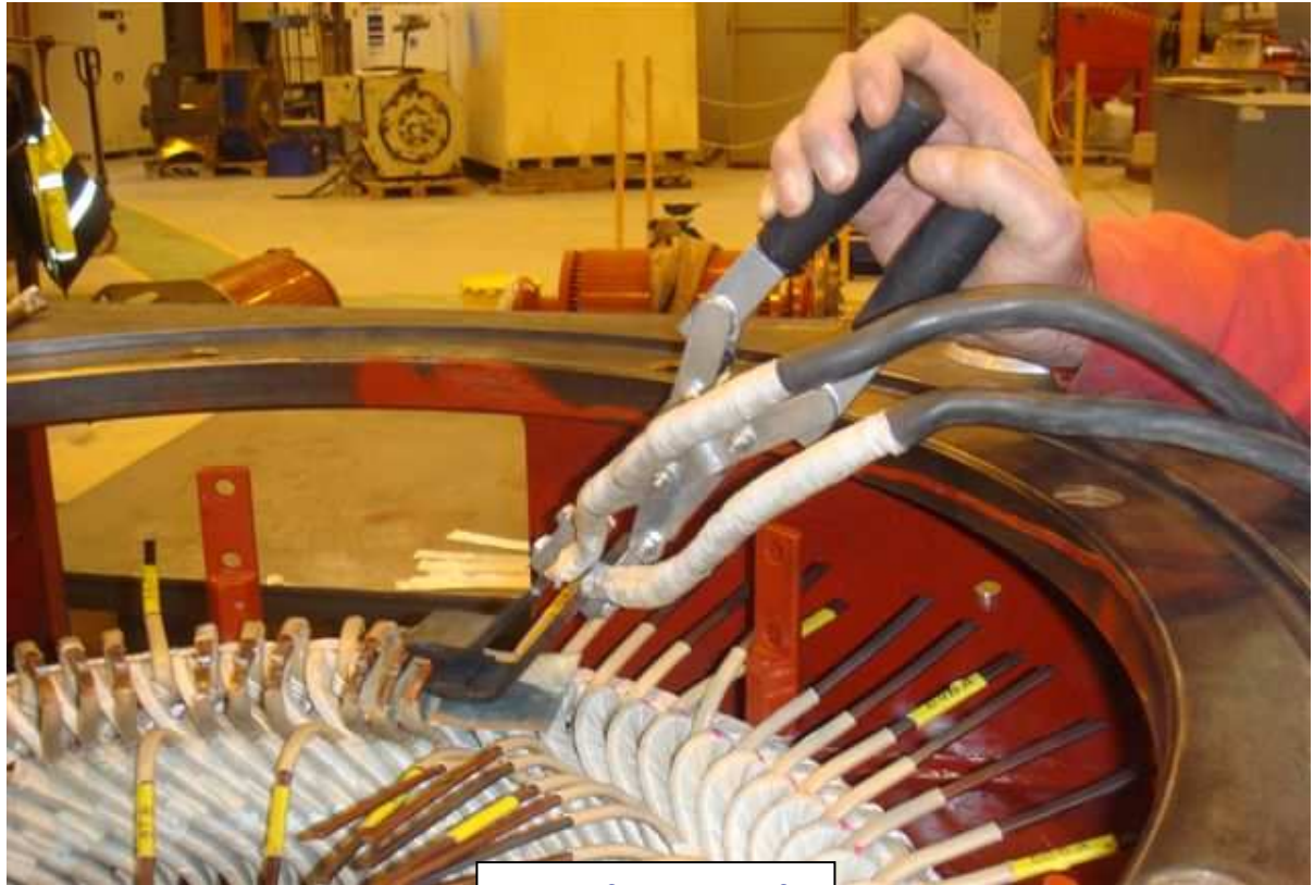
Modified pair of: ABT Brazing tongs