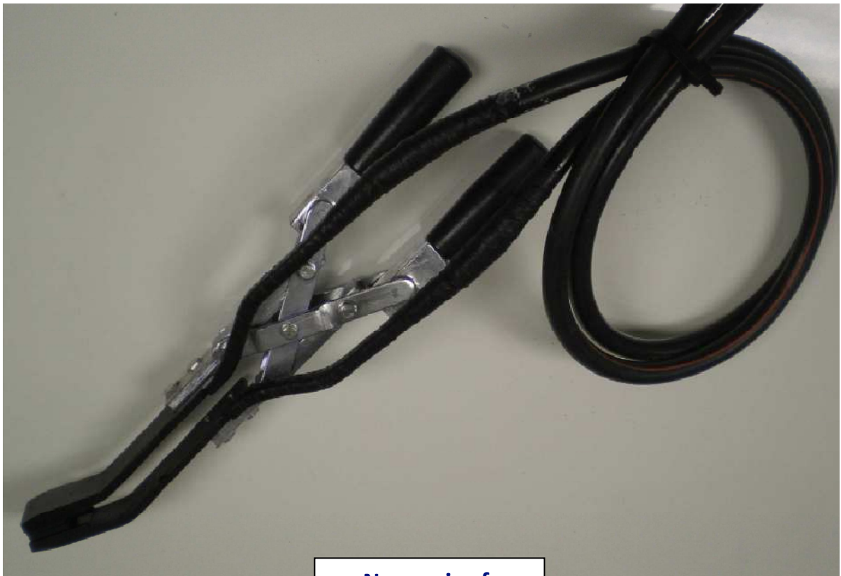
New pair of: ABT Brazing tongs